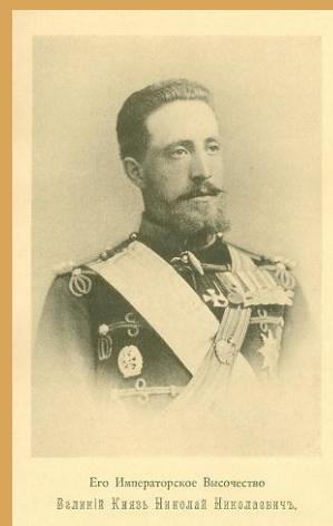
Его Императорское Высочество Великий Князь Николай Николаевич.

The creation of Imperial Society stimulated the foundation of two organizations in pre-revolutionary St. Petersburg. One was the Society of Purebred Dogs Lovers, created in 1886, and the second was the Division of Purebred Dogs of the Society for the Encouragement of Hunting Dogs and All Kinds of Hunting, created in the early nineties of the XIX century. Both of these societies were of closed type, so it was impossible to become a member of the society if you are not from the nobility. One must have good recommendations, and besides he had to undergo of so-called ballot at the general meeting. And moreover, the members of the Society were those with a certain prosperity. The number of members of the Society of Purebred Dog Lovers did not exceed 250 persons, and the Society for the Encouragement had even less members.